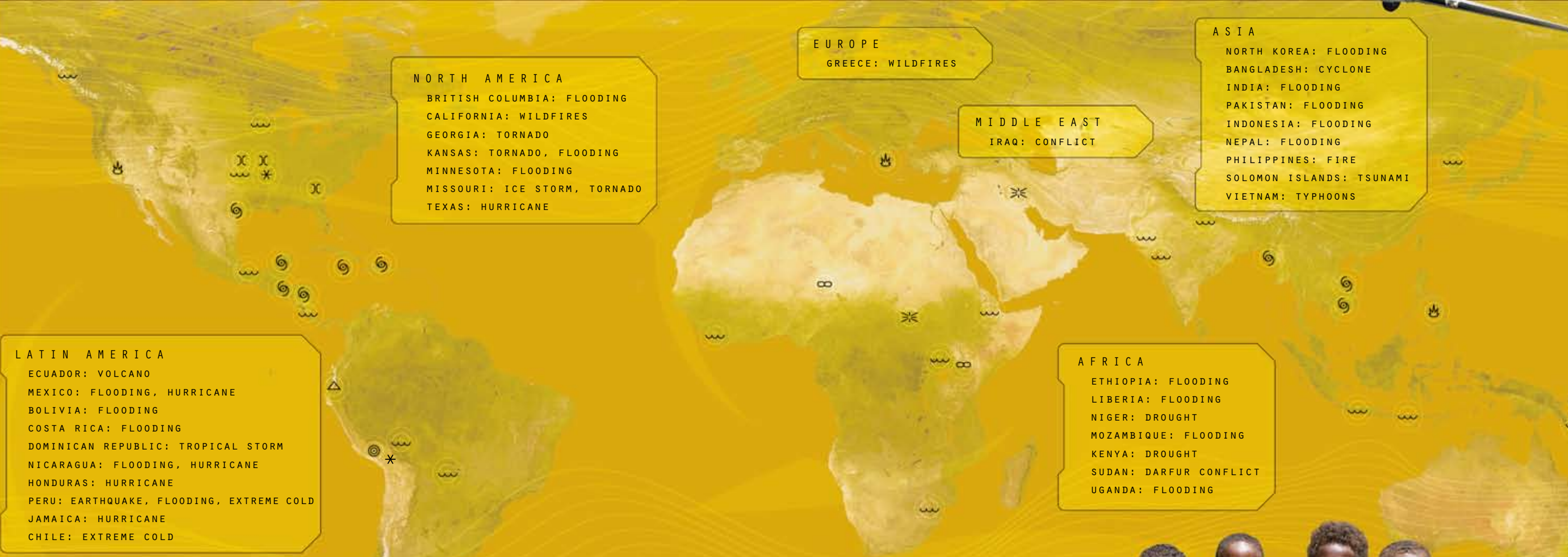
WORLD SATELLITE MAP COURTESY OF NASA.