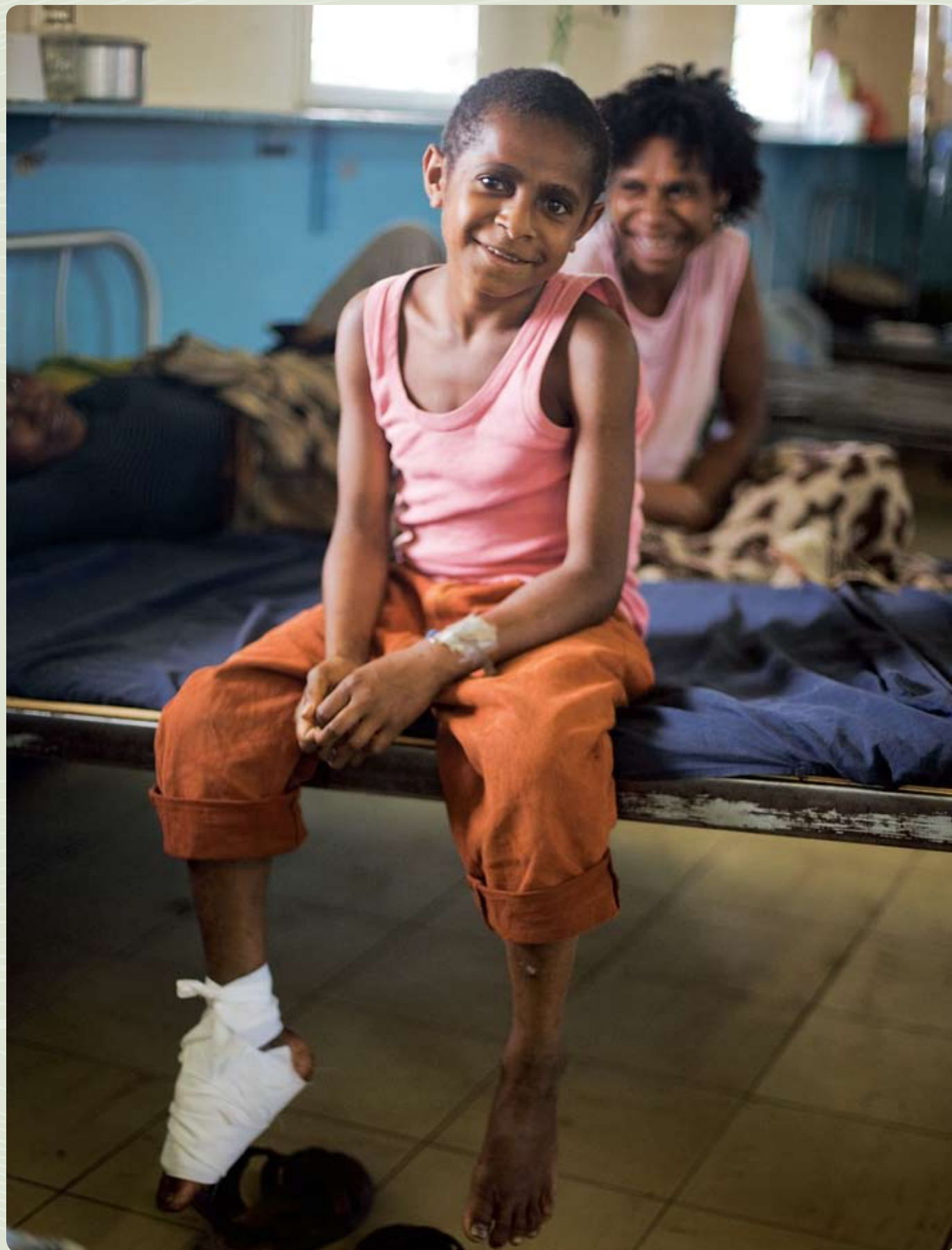
COMPASSIONATE CARE: Volunteer doctors and dentists serving with World Medical Mission provide physical and spiritual care for their patients, including this boy in Papua New Guinea.

So they set out and went from village to village, preaching the Gospel and healing people everywhere.