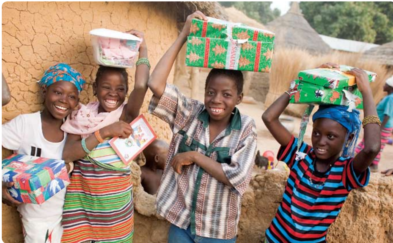
ALL OVER THE WORLD: In 2007 we shipped shoe boxes to over 100 countries, including this remote village in the land-locked African country of Mali.

That simple act of love opened the doors for the local church to tell the animist priests about the sacrificial love of Jesus, and God began to soften their hearts. As part of their traditional religious practices, they had offered animal sacrifices to appease the gods. Now