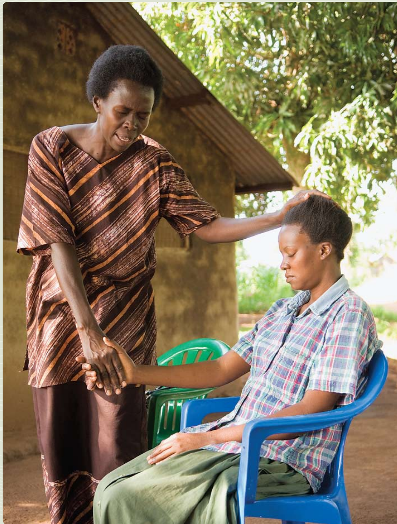
POWER OF PRAYER: Samaritan's Purse trains local Christians to reach out with the love of Christ to people in their communities who are affected by HIV/AIDS.