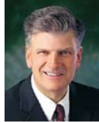
Franklin Graham ▲ President and CEO Samaritan's Purse and Billy Graham Evangelistic Association BOONE, NC Elected 1979