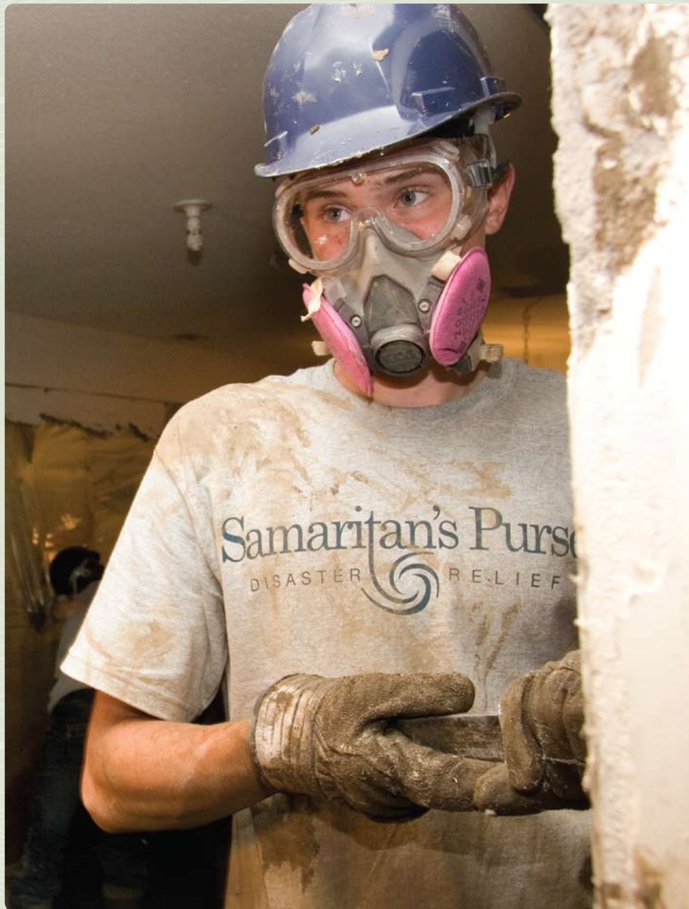
GIFTS OF SERVICE AND HOPE: A Relief Team volunteer cleans out a flood-damaged home in Terrace, B.C. Volunteers from throughout the region joined Samaritan's Purse Canada staff, using equipment housed in our mobile Disaster Relief Unit to clean out more than 50 homes for displaced residents.