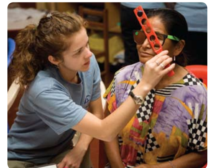
CLEAR SIGHT: An important part of many Teams trips is participation in eyeglass clinics, medical clinics, and dental clinics.

Samaritan's Purse Teams use the amazing abilities that God has given us to carry the grace and truth of Jesus Christ to the world.