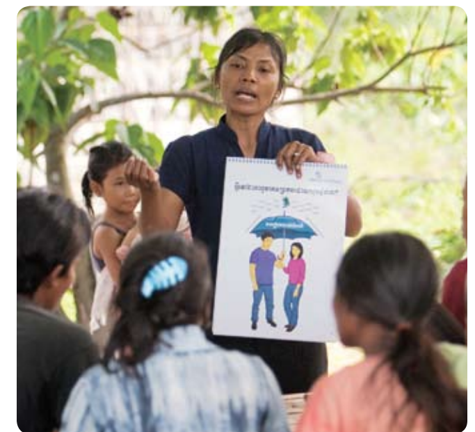
PROFOUND TRUTH: Workers in Cambodia teach young people how God's plan of pre-marital abstinence and marital faithfulness protects them from HIV/AIDS.