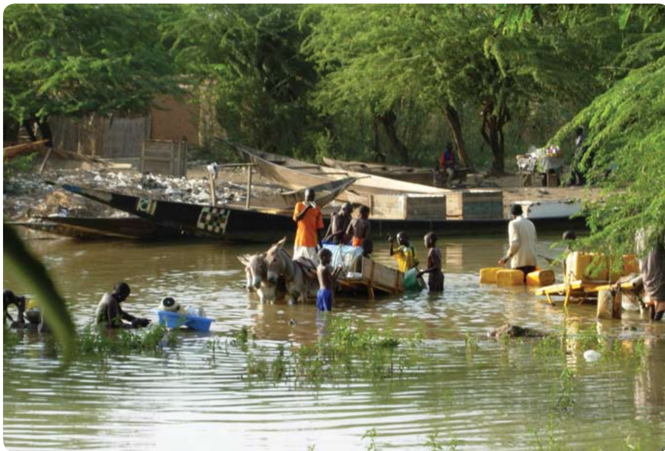
PROVIDING SAFE DRINKING WATER: Samaritan's Purse partners deliver BioSand Water Filters—funded by our Turn On The Tap initiative—to people living by the gravely-contaminated Niger River. Our Household Water Program also places special emphasis on teaching proper hygiene and sanitation practices.

In addition to building and installing water filters, Samaritan's Purse is working with local partners to provide latrines and valuable health and hygiene education to people of all ages. Through our work we seek to engage the community in affecting change.