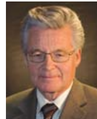
The Honourable E. Darrell Riemer Judge of the Provincial Court of Alberta RED DEER, AB Elected 2007