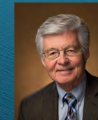
The Honourable E. Darrell Riemer Judge of the Provincial Court of Alberta RED DEER, AB Elected 2007