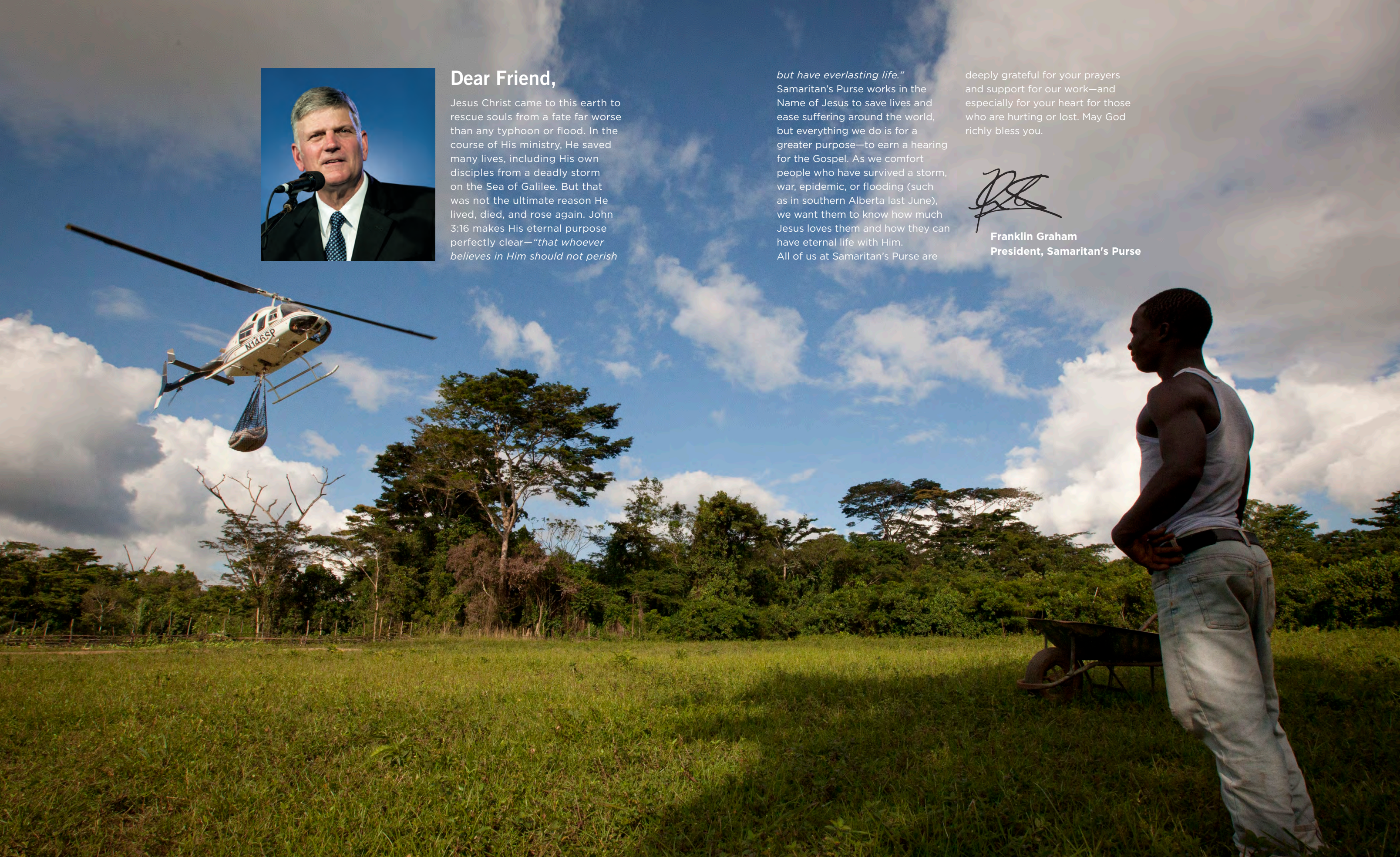
Franklin Graham President, Samaritan’s Purse

A handwritten signature in black ink, appearing to read 'Franklin Graham'.