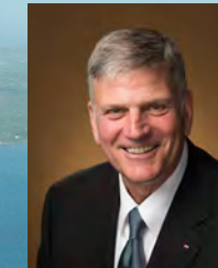
Franklin Graham ▲ President and CEO Samaritan's Purse and Billy Graham Evangelistic Association BOONE, NC Elected 1979